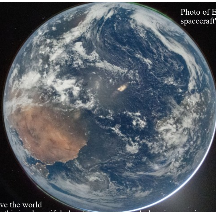
Photo of Earth from the Orion spacecraft's window on April 2, 2026.

“...for just a moment, have the world pause and remember that this is a beautiful planet in a very special place in our universe, and we should all cherish what we have, what we have been gifted.” – Reid Wiseman, Artemis II Commander.